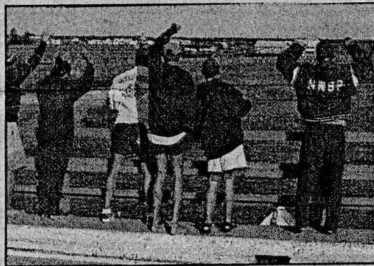
Supporters gather on a bridge to cheer on their favorite boats.